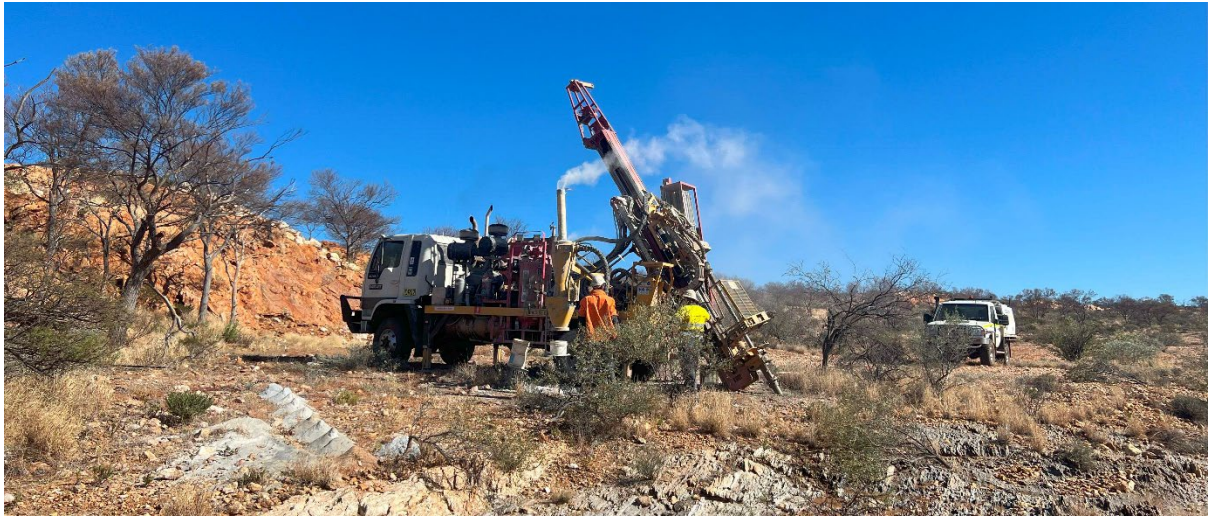
Figure 4 – Drill Rig at Pegmatite Creek Prospect, Mortimer Hills Project.