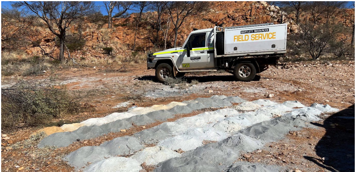
Figure 5 – Drill hole MHC002 with 34m of pegmatite intercepted.