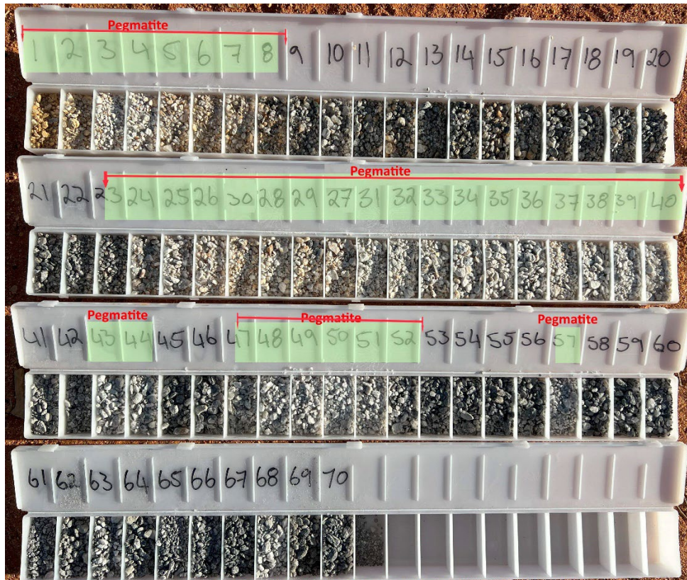
Figure 2 – MHC002 Chip tray with 34m of pegmatite intercepted.